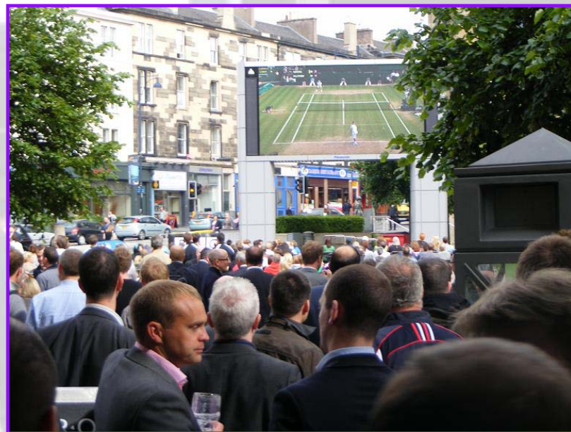
Wimbledon coverage - Edinburgh