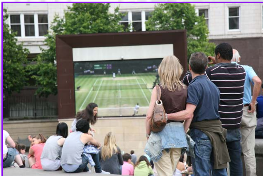
Wimbledon coverage - Birmingham