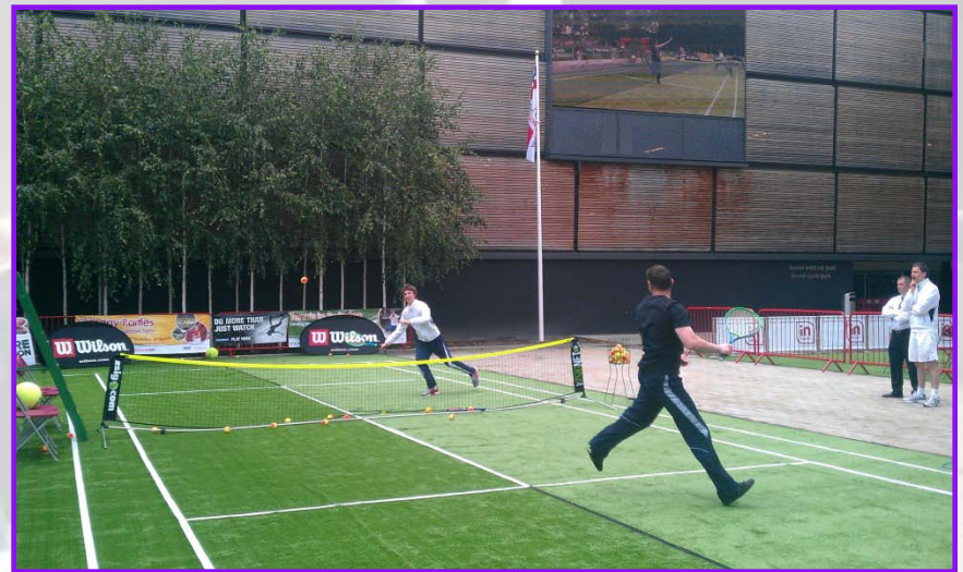
Wimbledon activity - Swindon