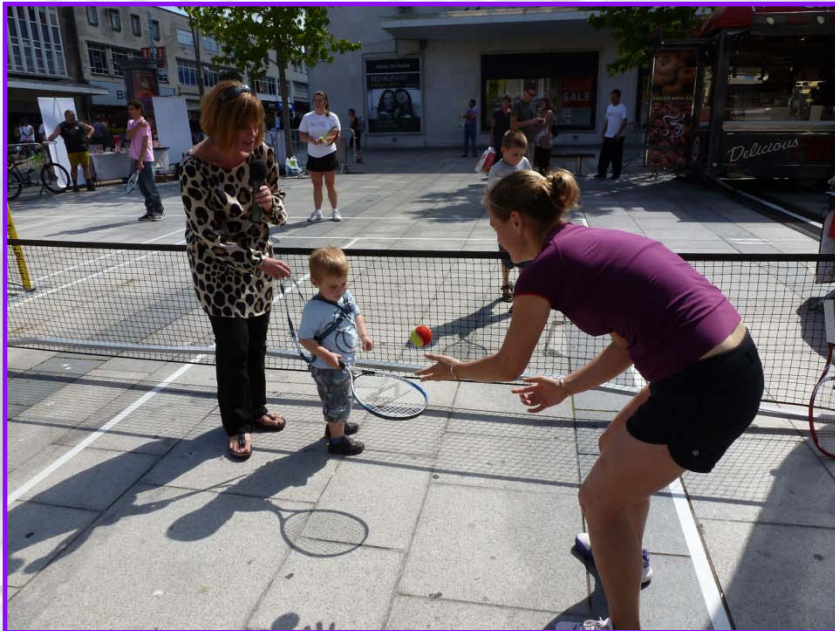
Wimbledon activity - Plymouth